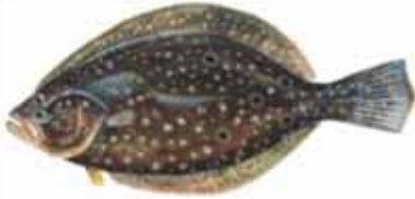
Summer Flounder (Fluke)

Del. Bay and Tributaries 3 Fish at 17 Inches