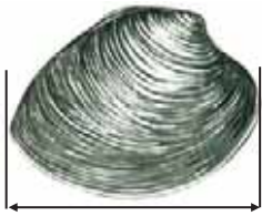
Hard Clam 1.5 inches