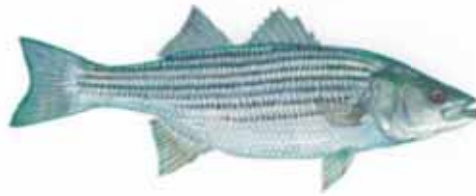
Striped Bass or Hybrid Striped Bass

1 fish at 28 inches to less than 43 inches