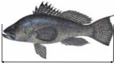
Black Sea Bass

10* fish at 12.5 inches May 15 – June 22