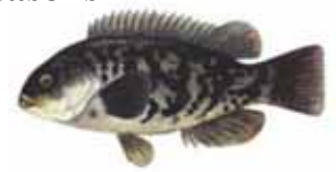
Tautog 15 inches